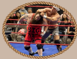
PRO WRESTLING SHOW $5,000