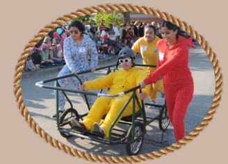
BED RACES $5,000