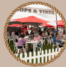
HOPS & VINE GARDEN