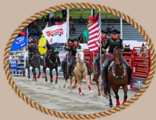
RODEO PARADE $7,500