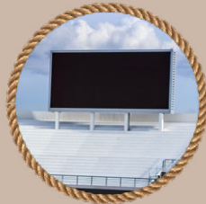
RODEO REPLAY SCREEN