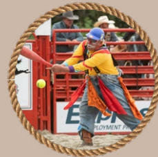
ENTERTAINMENT ACTS (Rodeo Clown, Bullfighters, Specialty Act, Grand Entry Team)