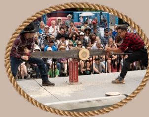
LOGGER SPORTS SHOW $5,000