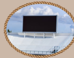
OUTDOOR VIDEO SCREEN $5,000