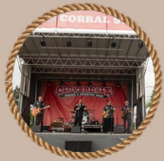
CR CORRAL STAGE