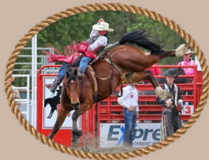
BAREBACK RIDING $15,000