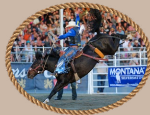
SADDLE BRONC RIDING $15,000