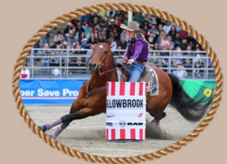
LADIES BARREL RACING $15,000