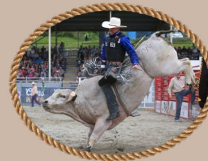
BULL RIDING $15,000